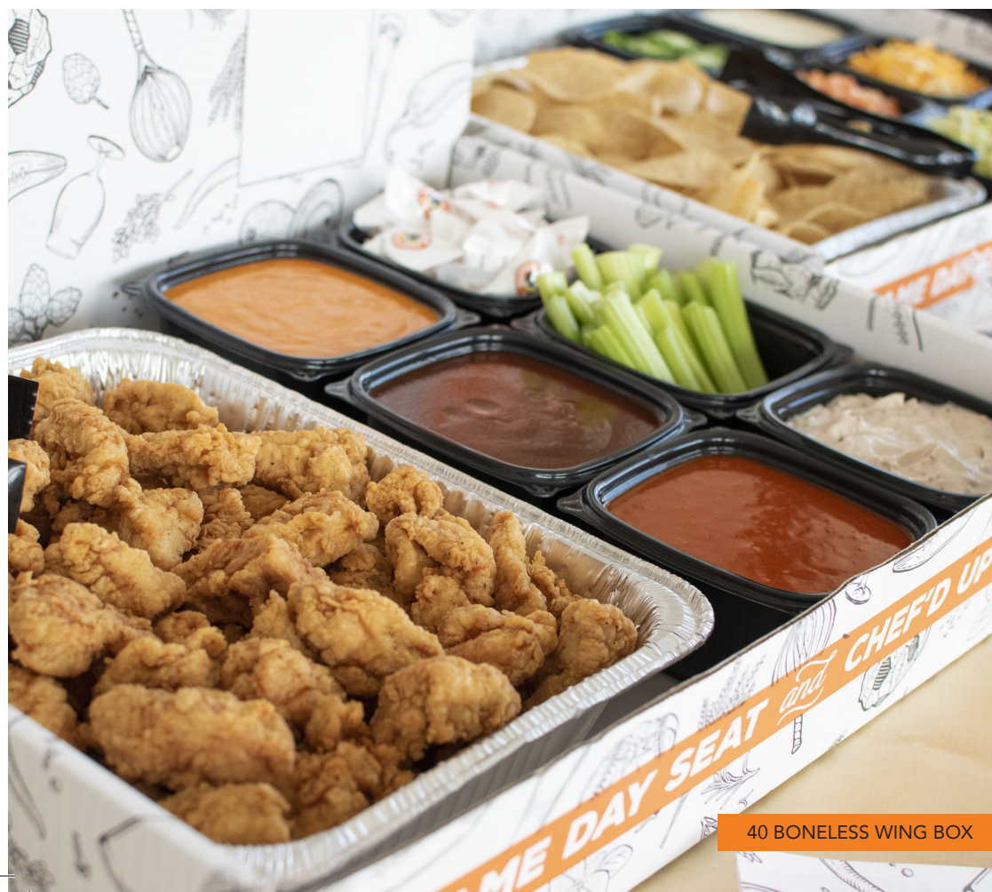
40 BONELESS WING BOX

Boneless grilled available upon request.